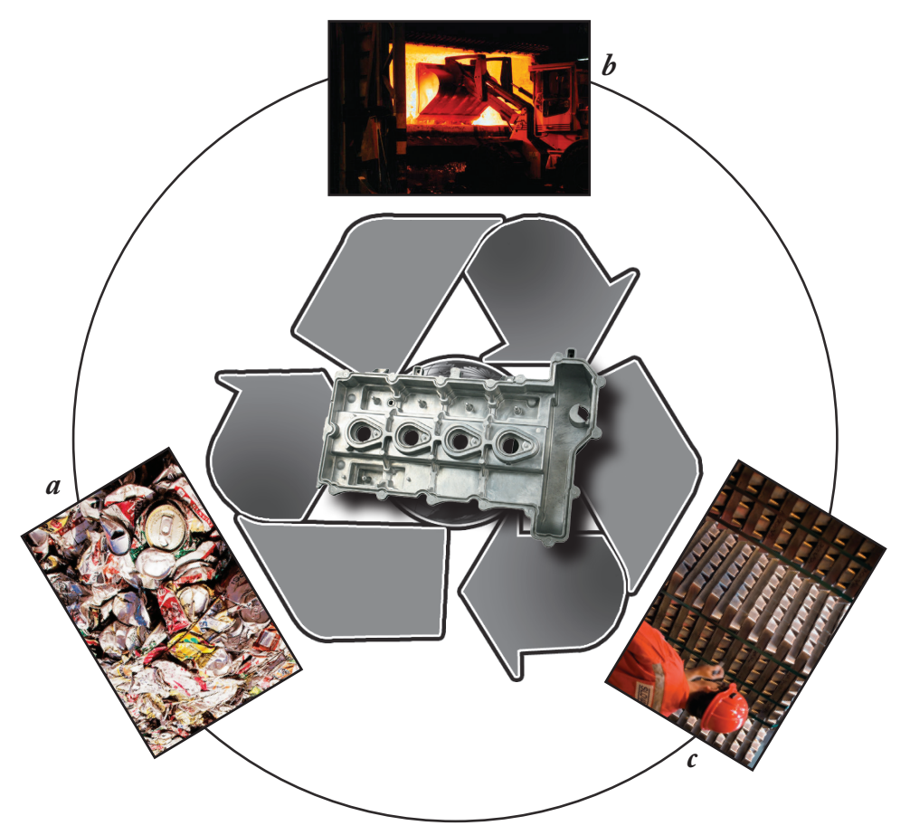
Figure 1–1 Circle of recycling to create a die casting. Recycled cans are collected (a), cans are remelted with other aluminum scrap (b) to create ingots (c), ingots are used to create a die casting (center).

The need for manufacturers to focus on ecological consequences has been stated not only by business management scholars from institutions like Northwestern's Kellogg School of Management and the University of Michigan, but by business leaders as well. Companies like AT&T, NCR, Whirlpool Corp., DEC, and Northern Telecom have publicly addressed the issue.